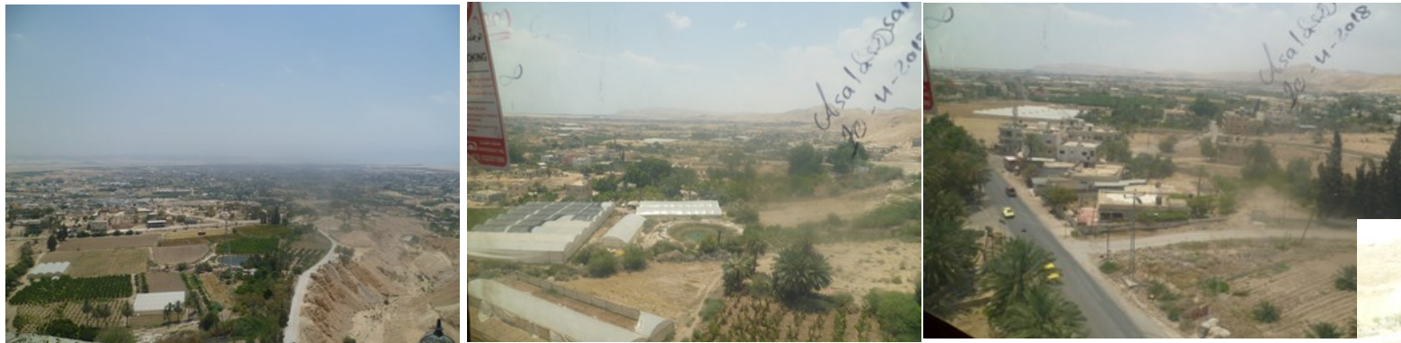
Ariel view of Jericho