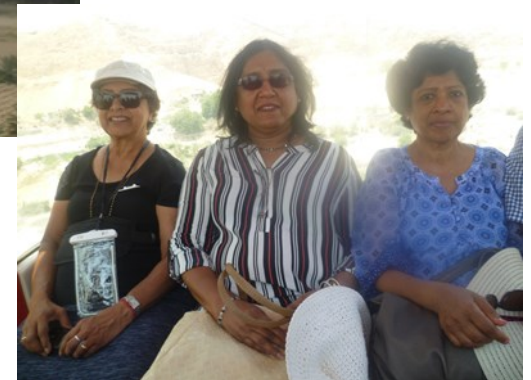
Journey by cable cars to mount of Temptation. Beautiful view.