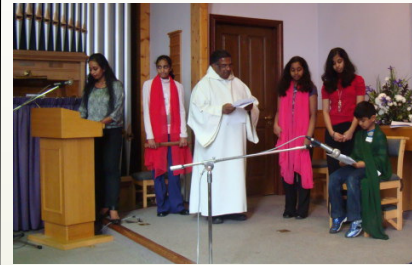
Youth Service 27.03.2011