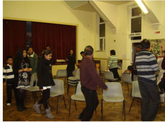
Christmas Tree 2010