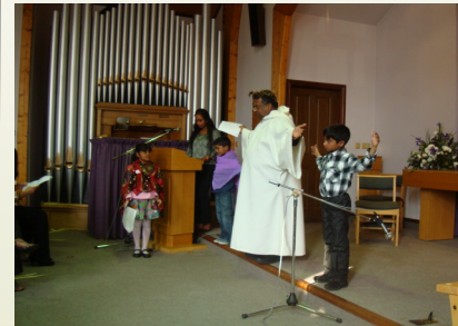
Family Retreat at Woldingham